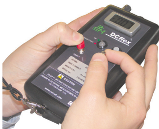
Press the reset button. Null the offset trimmer to zero

The DCflex current probe is simple to use