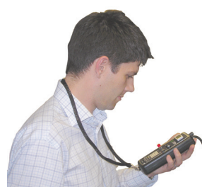
Take the reading